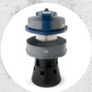
Ultra FilteRing System