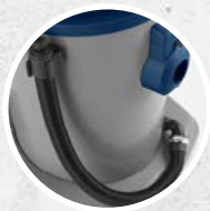
Drain hose to empty the container from liquids (PD).