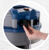
Exhaust air filter