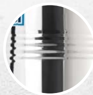
Stainless steel container sturdy and durable