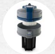
Ultra FilteRing System