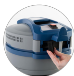
Inlet and outlet of the motor cooling air