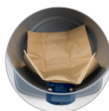
Paper filter bag (optional)