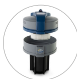
Ultra FilteRing System