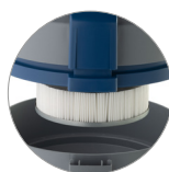
PTFE cartridge filter (M filtration class)