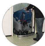
Adjustable and compact squeegee