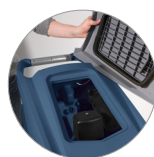
Debris tray + recovery tank filter