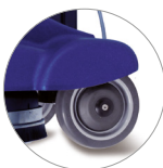
Non marking wheels