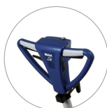
Handle (front view)