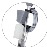
Spray electric system