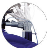
Articulation of the handle