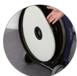
Floating pad drive system