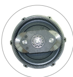
Planetary gear (L22)