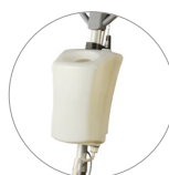
Tank 12 l