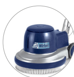
New plastic cover (L22)