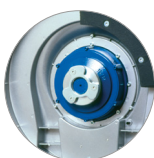
Mount for drive board and brushes