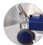
Articulation of the handle