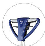
Ergonomic handle (front view)