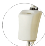
Tank 12 l