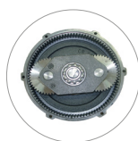
Planetary gear (L22)