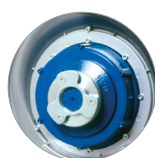
Mount for drive boards and brushes