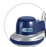
New plastic cover (L22)