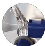
Articulation of the handle