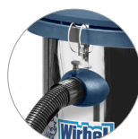
Quick hose coupling