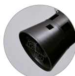
Cage bag support with floater