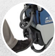
Foot pedal squeegee lifting system