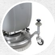
External wheel, adjustable pressure