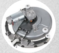
Squeegee and rotation (up to 270° rotation)