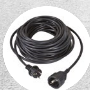
15 m detachable cable