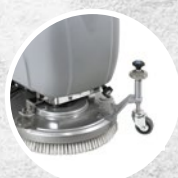
External wheel, adjustable pressure