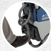
Foot pedal squeegee lifting system