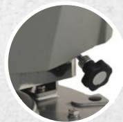
Front knob adjustable deck