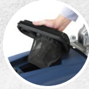
Removable lid + floating ball + filter