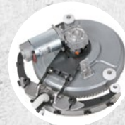
Squeegee and rotation (up to 270° rotation)